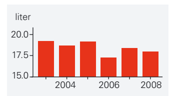
Heating oil consumption per chair